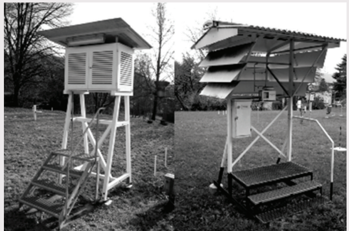
A standard Stevenson screen and a historical French screen measuring in parallel at an observatory in Basel, Switzerland.

produced by transitions that occurred in many regions. Important potentially biasing transitions are the adoption of Stevenson screens or the introduction of automatic weather stations. Thus a large global parallel dataset is highly desirable as it enables the study of systematic biases in the global record.