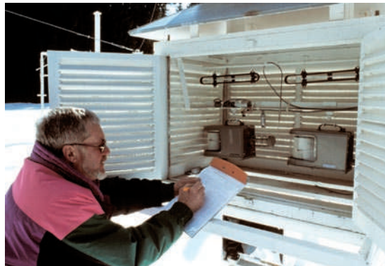
Manual weather stations like these are being automated.

In many cases a weather station's instrumentation, location, time of observation, or environment (such as proximity to buildings) has changed. While such changes aren't of concern for weather forecasting, which deals with day-to-day temperature swings of several degrees, they are relevant for monitoring long-term decadal changes, where fractions of a degree make a difference. Unfortunately, the timing and effect of most of these changes have not been recorded. Over the past 60 years, the WMO has worked to standardize measurement practices by national meteorological services, but there are still plenty of data collected not using these standards. In addition, the person reading the thermometer, an analyst